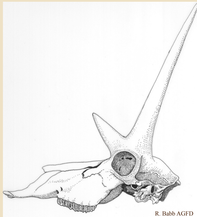
Shuler's pronghorn skull.